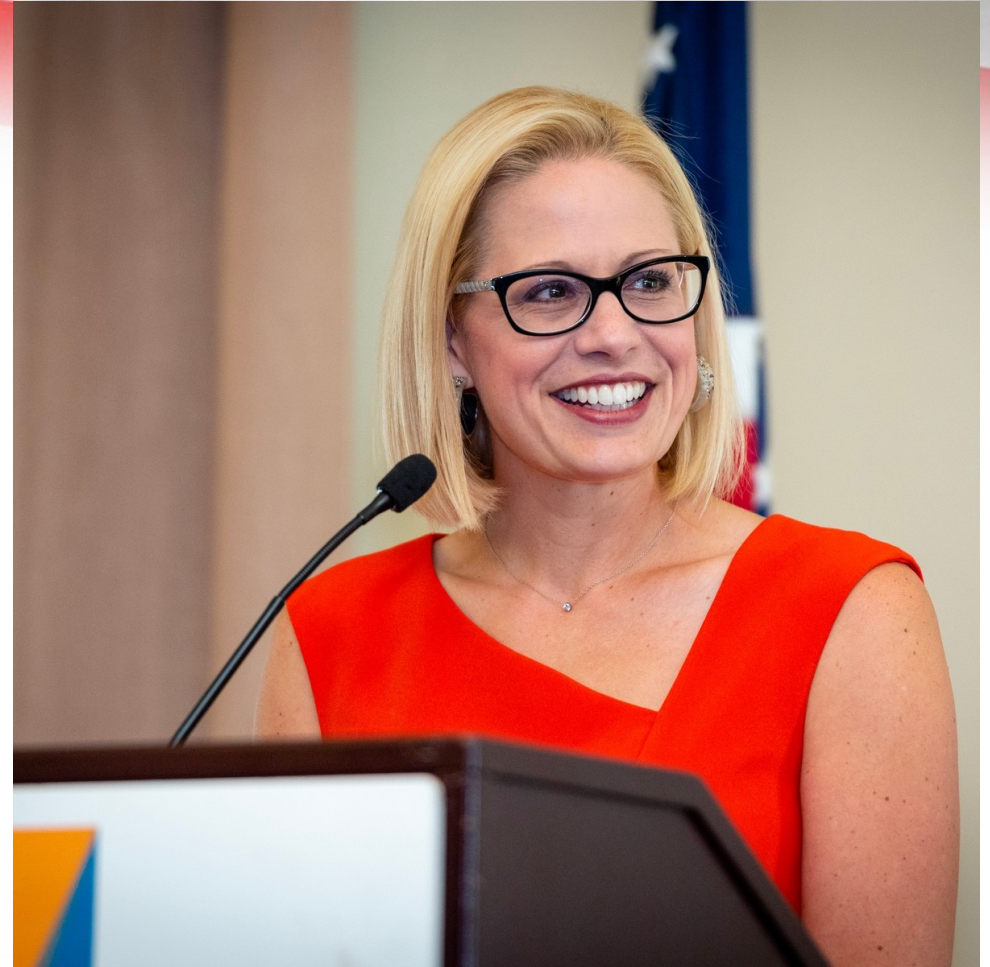
Sen. Kyrsten Sinema (AZ) (202) 224-4521