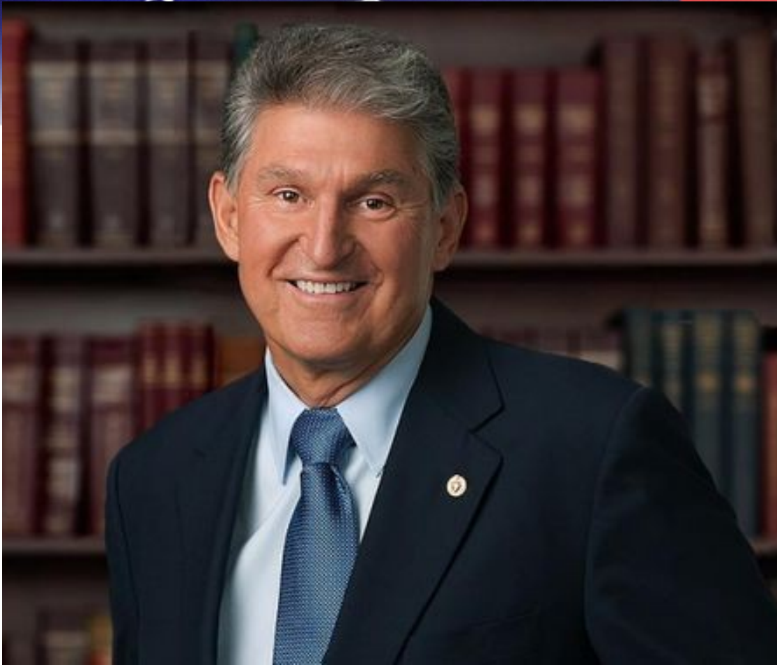
Sen. Joe Manchin (WV) (202) 224-3954